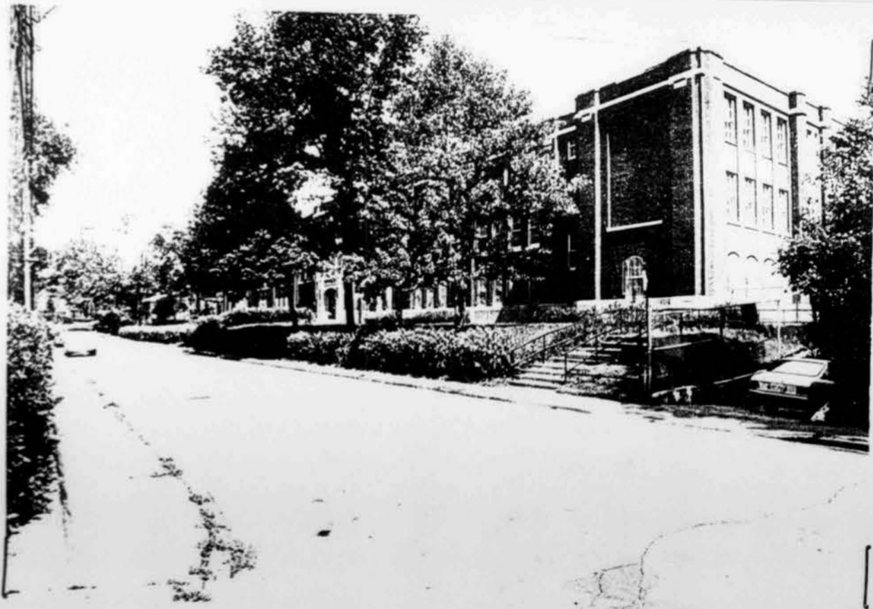
IONA High School 5000 rue Iona plus Queen Mary Mtl