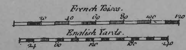
(Copy of a "Spy" Map printed in London, England, 1758, by Thomas Jeffreys, Geographer to H.R.H. the Prince of Wales.)

PLAN of the Town and FORTIFICATIONS of MONTREAL or VILLE MARIE in CANADA