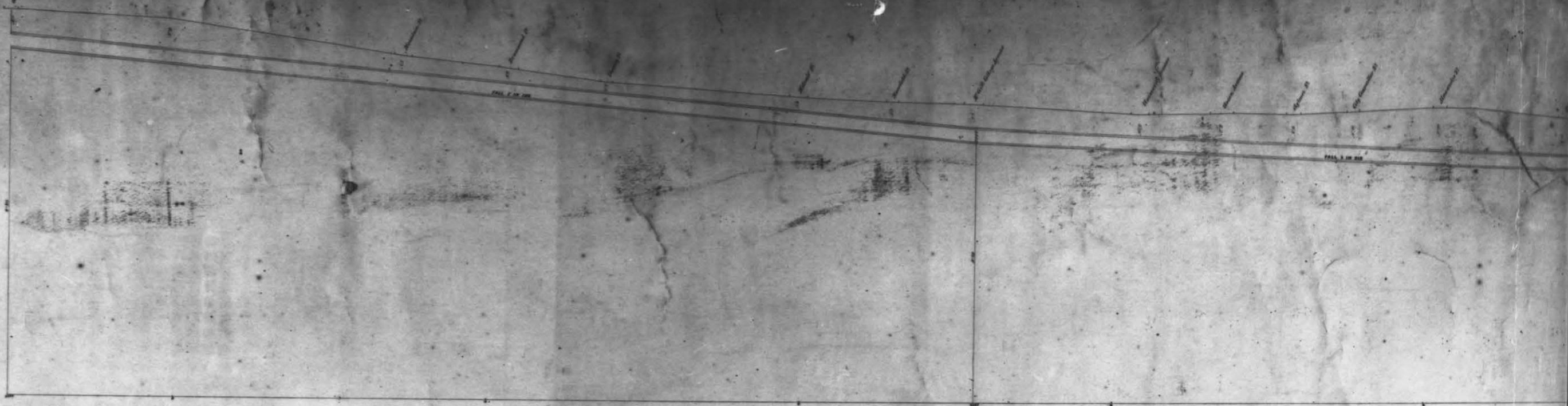
SECTION OF SEWER THROUGH CATHERINE ST TO BLEURY AND BERTHELET STS