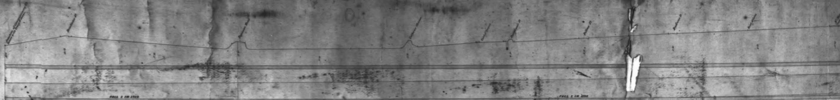
SECTION OF PROPOSED OUTLET SEWER FROM S T MARYS TOLL GATE TO NEAR PAPINEAU ROAD