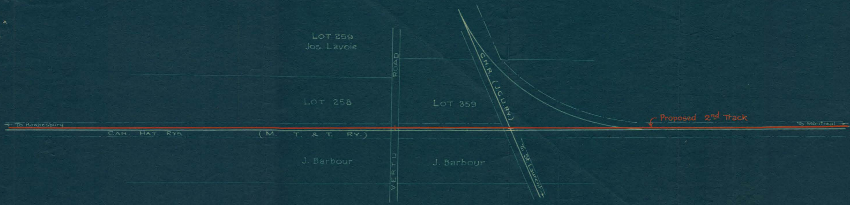
PLAN Scale: 1" = 400'