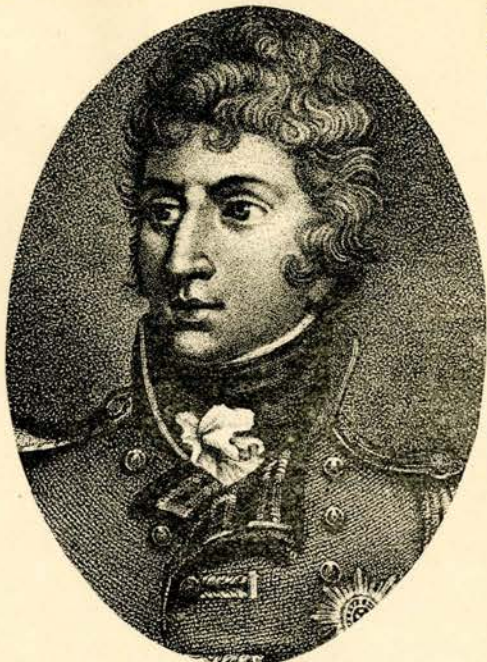
SIR JOHN COAPE SHERBROOKE.