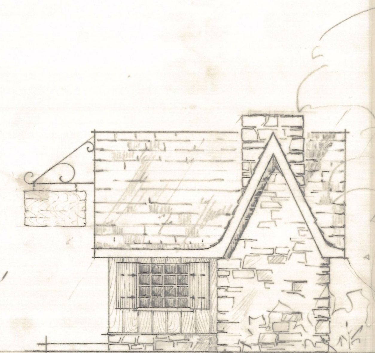
ELEVATION - 2