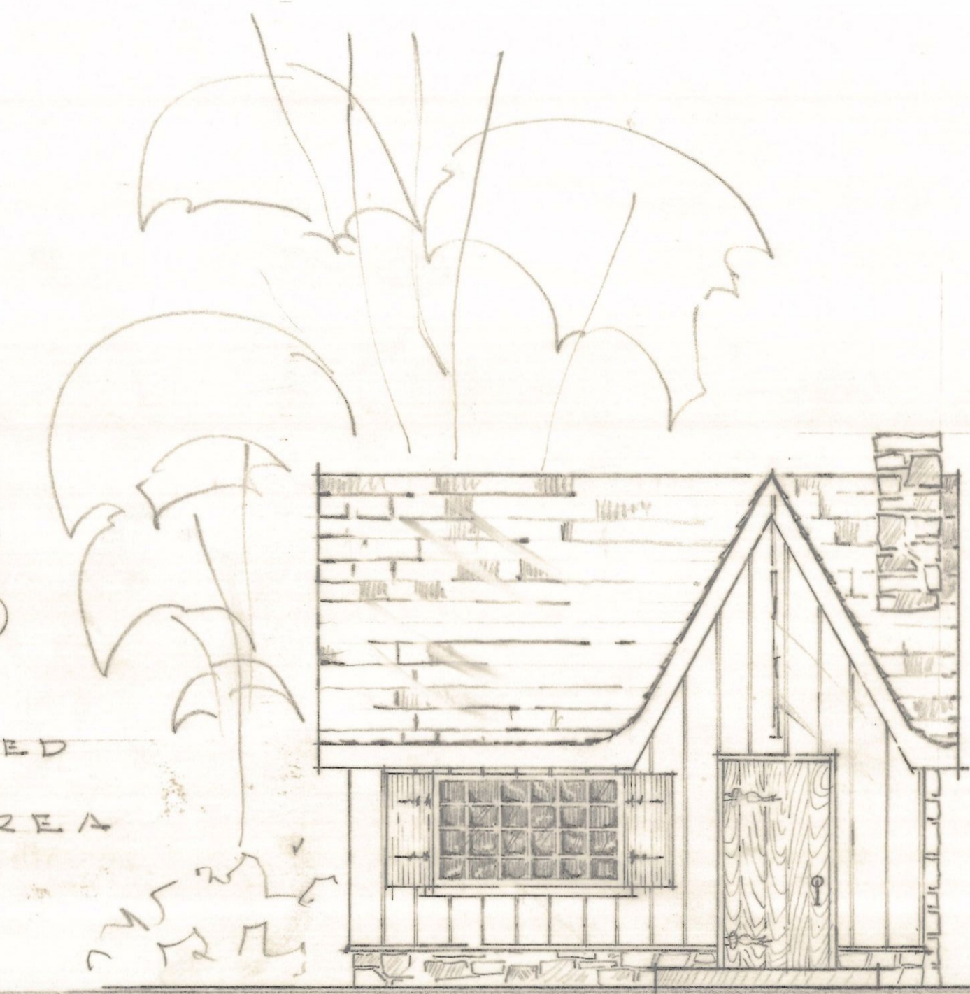
ELEVATION - 3 SCALE: 1/2" = 1'-0"