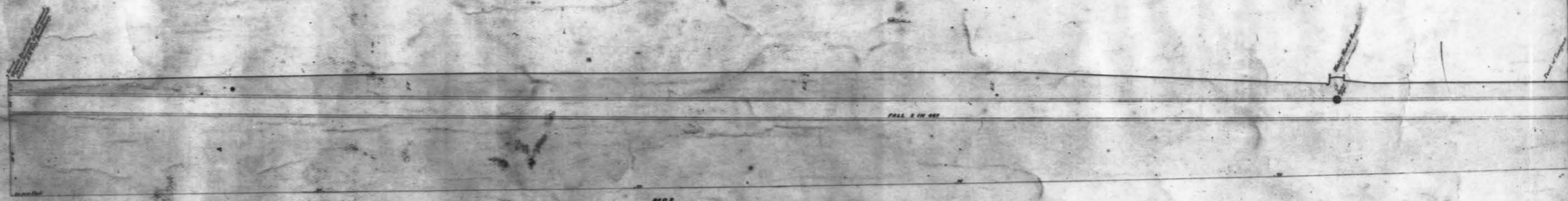
N°1 SECTION OF SEWER THROUGH LOW GROUND TO THE TANNERIES